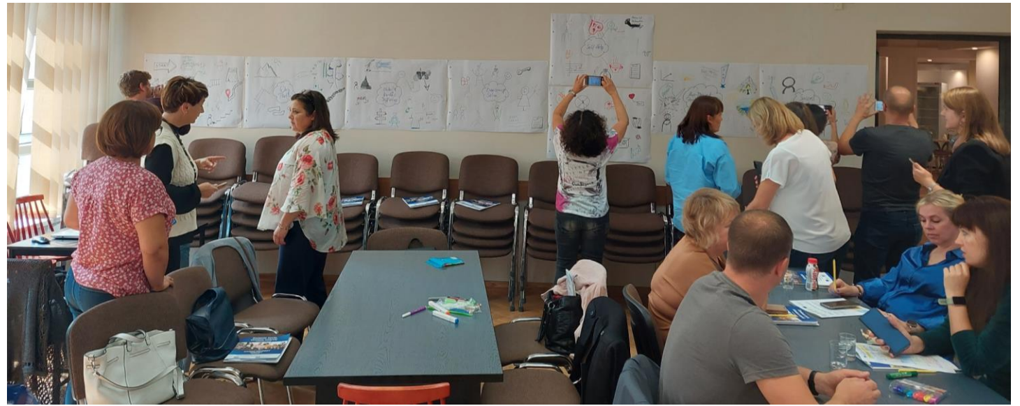
Visualisation exercises to support the implementation of the Learning-PerLe (in module 3) with own classes